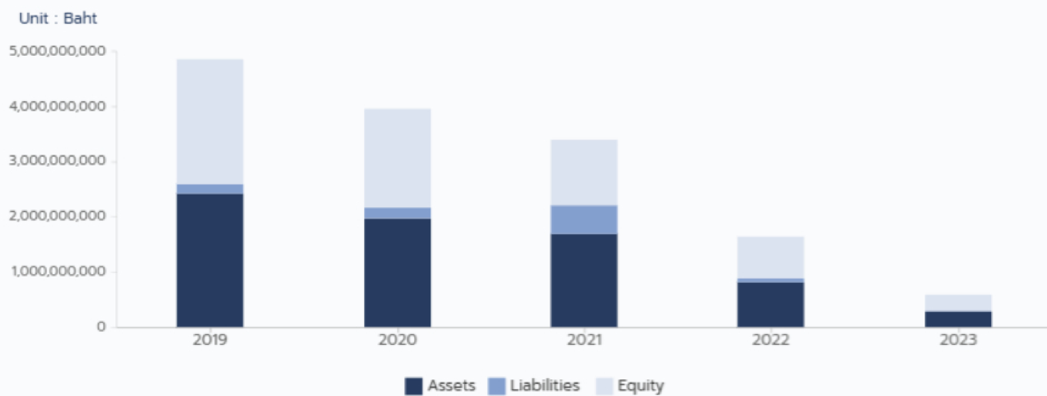
Balance Sheet Proportion