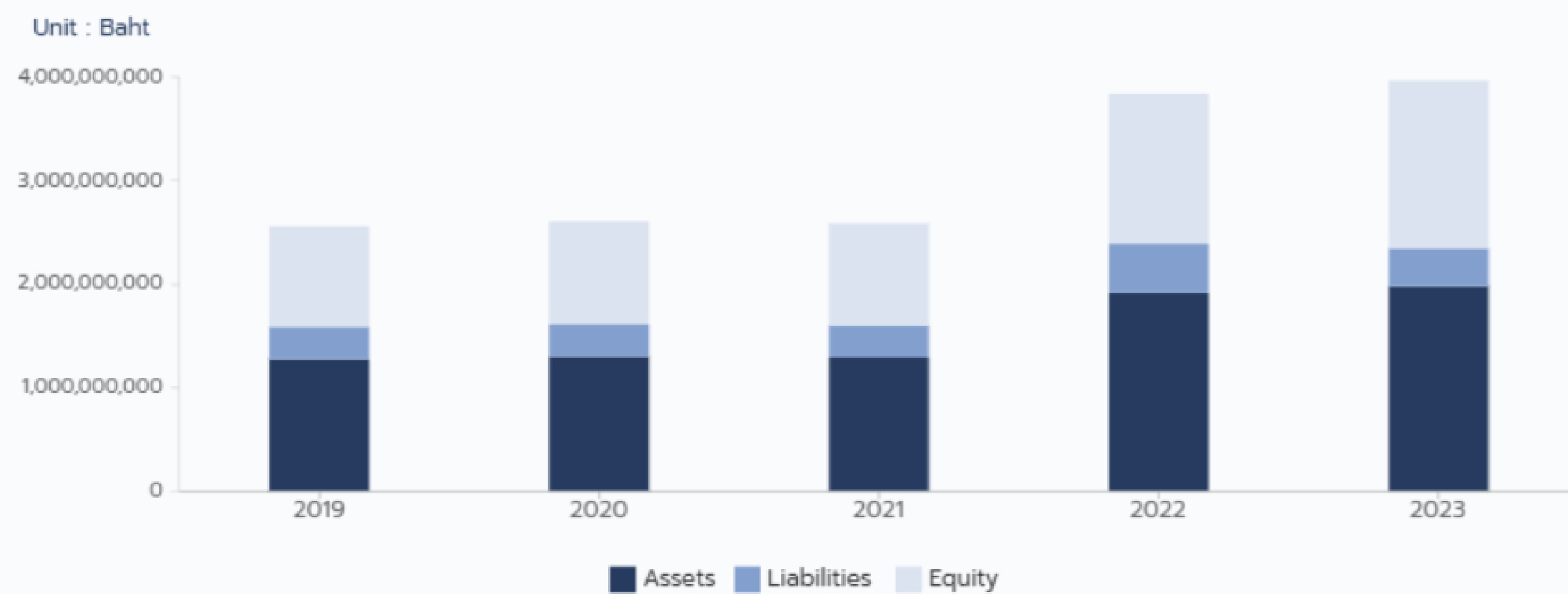
Balance Sheet Proportion