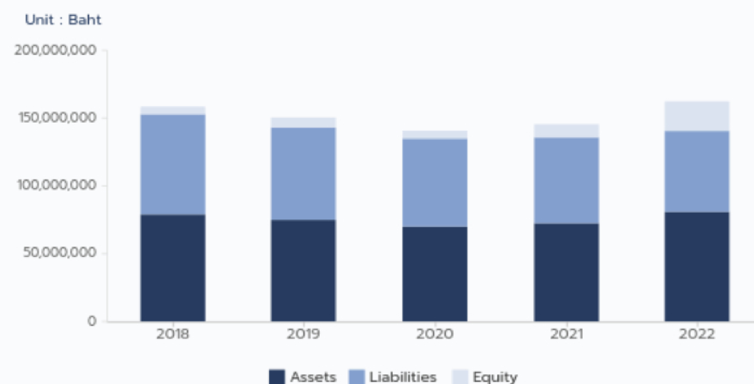
Balance Sheet Proportion