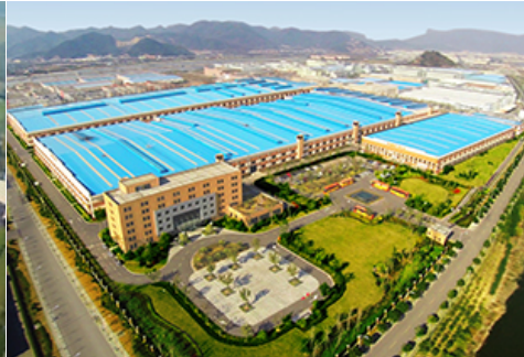
Boway Binhai Industrial Park