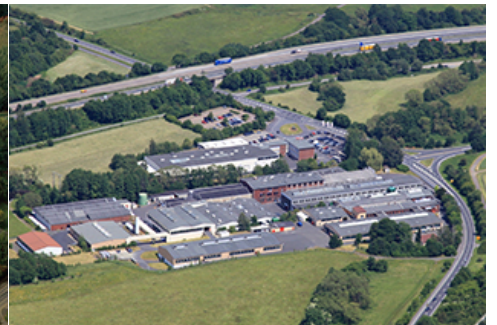
Germany Herborn Industry Park