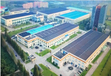
Bode Hightech Industrial Park

Boway Group companies own hundreds of patents around the globe, with many more currently in various stages of approval in various nations. The number already granted totals 62 unique invention patents in China and 109 in other countries, including many in Europe and one in the United States. Further evidence of corporate heft rests in the fact that the firm has specifically drawn up over 18 national standards and 5 industry standards to date, and that Boway Group has been granted an AAA credit rating by the Chinese banking sector for 18 consecutive years.