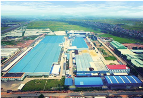
Vietnam Bac Giang Industrial Park