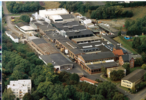
Germany Heuchelheim Industry Park