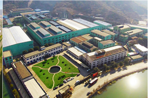
Boway Yunlong Industrial Park