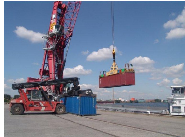
Left Bank: Barge Terminal