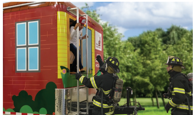
The Hartford's Fire Safety House: Simulated fire and smoke demonstration to help educate students on fire safety that will travel to select cities identified by the fire index.